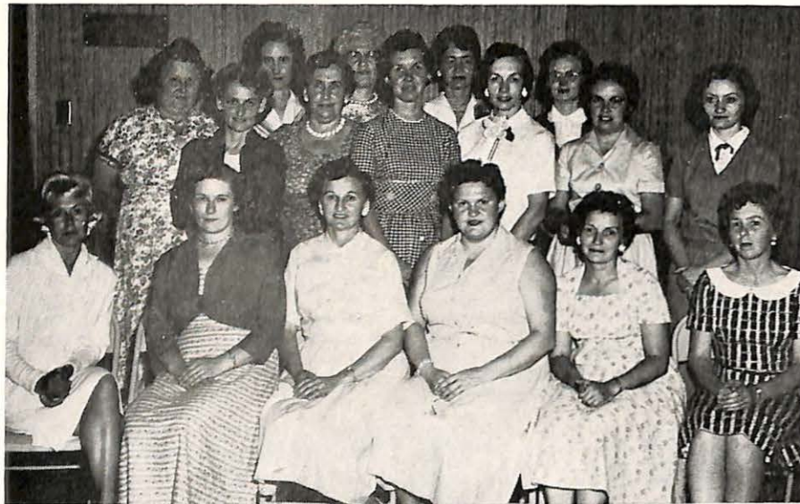
Officers of the Woman's Missionary Society, Magnolia Baptist Church, Anaheim, California. (Their names are given in the accompanying report).