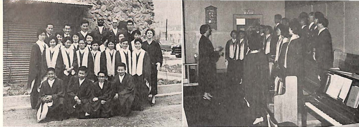
KOREAN CHAPEL CHOIR, PUSAN, KOREA