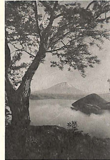
Beautiful Mt. Ezo Fuji at Hokkaido, Japan.

Public opinion polls have indicated that the majority of the Japanese people are definitely against this new revision. Why? There are many reasons, and complicated ones. Under United States leadership, Japan's present Constitution was framed, which forever