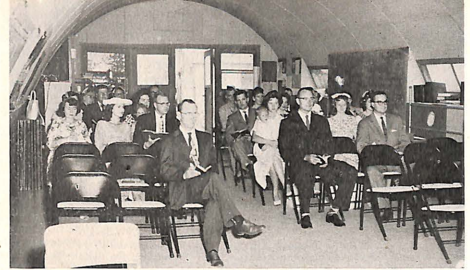
The Adult Sunday School Class of the Bolsa Baptist Church, Midway City, Calif., which is meeting in the Quonset building in which the church's worship services are also held.

seemed clear. The need was even greater than it was in 1955. I was experienced and in good health. The family was willing.