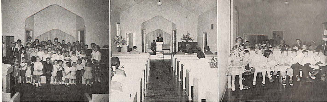
CHURCH EXTENSION SERVICES, JUNCTION CITY, KANSAS

One of the first worship services in Junction City, Kansas (center) held in the Seventh Day Adventist Church. At the left is a recent picture of the encouraging Vacation Bible School, and the Sunday School with 51 present held on May 1, 1960 is shown at the right.