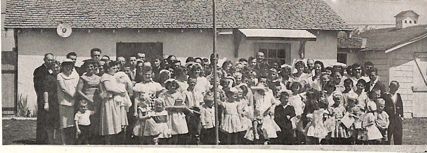
BOLSA BAPTIST SUNDAY SCHOOL