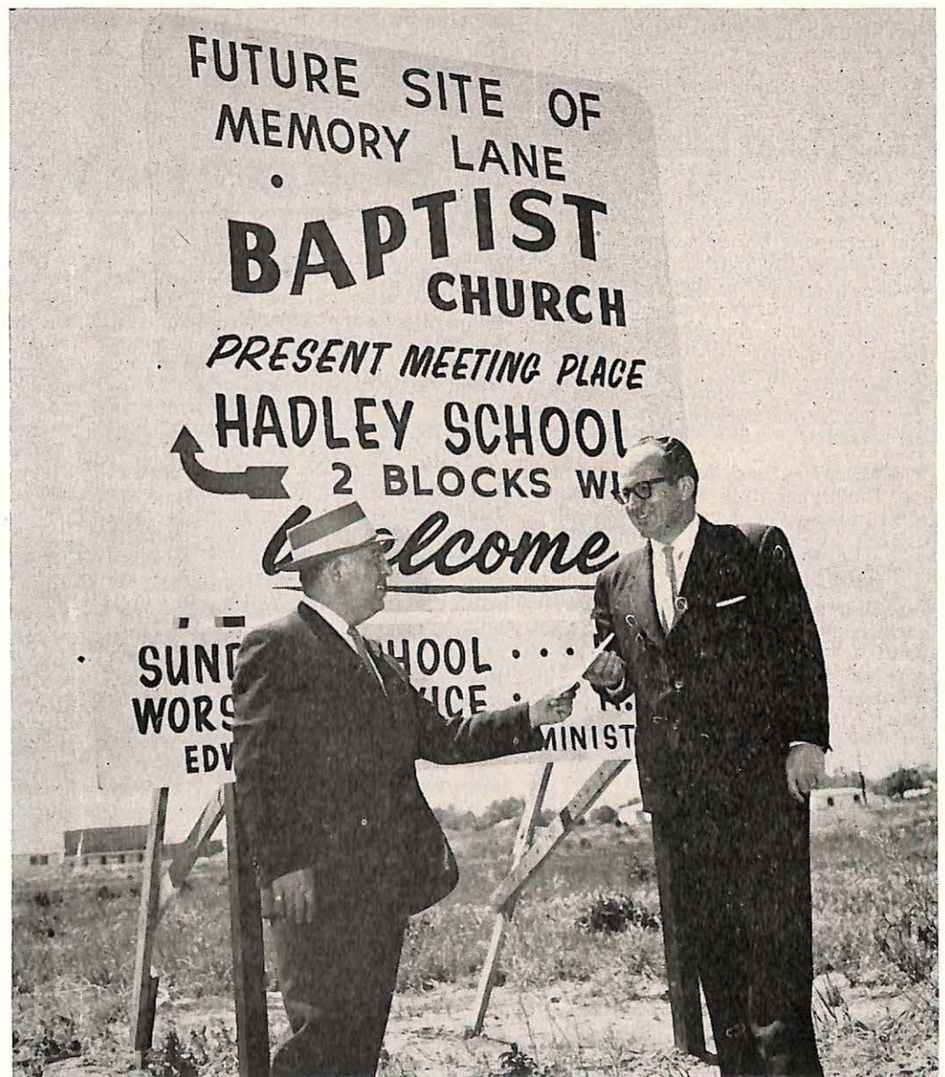
Church Extension Beginnings, Wichita, Kansas

NORTH AMERICAN BAPTIST GENERAL CONFERENCE