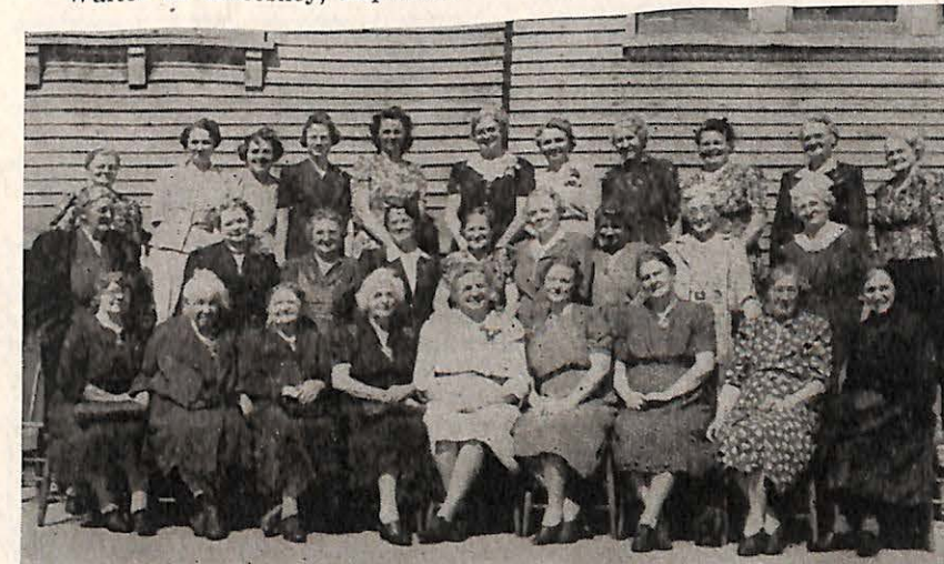
Members of the Women's Missionary Society of the Fifteenth St. Baptist Church of Los Angeles, Calif., on Its 58th Anniversary