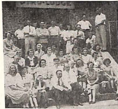
Young People at the Minnesota Assembly Recently Held at Snail Lake