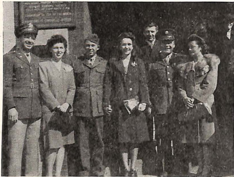
Service Men and Their Wives at the Fifteenth St. Baptist Church of Los Angeles, Calif.