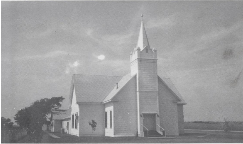
Built 1894 – remodeled and added on to numerous times