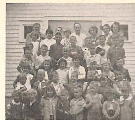
Children and teachers of the Vacation Bible School held by the First Baptist Church, McLaughlin, South Dakota.