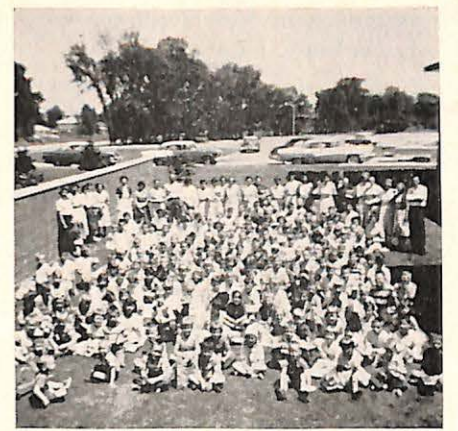
Vacation Bible School of the Grosse Pointe Baptist Church, Mich., with 212 pupils and 36 teachers and workers.