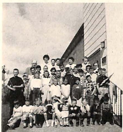
Vacation Bible School children and teachers of the Ebenezer Baptist Church Lehr, North Dakota.