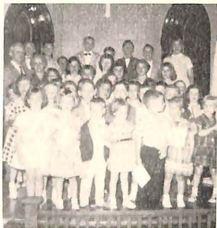
Vacation Bible School children and teachers of Sumner, Iowa, present their program in the Baptist Church at the close of the school week.