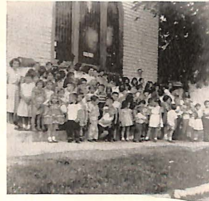
Vacation Bible School of the Bethel Baptist Church, Indianapolis, Indiana.