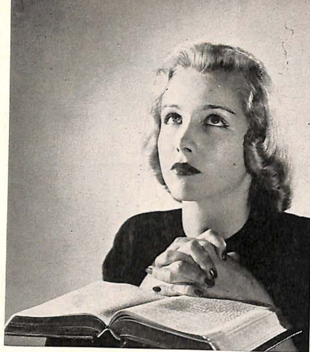
Tom soon learned that Mary Sue's beauty came deeply from her very soul which was completely at peace with her Savior.