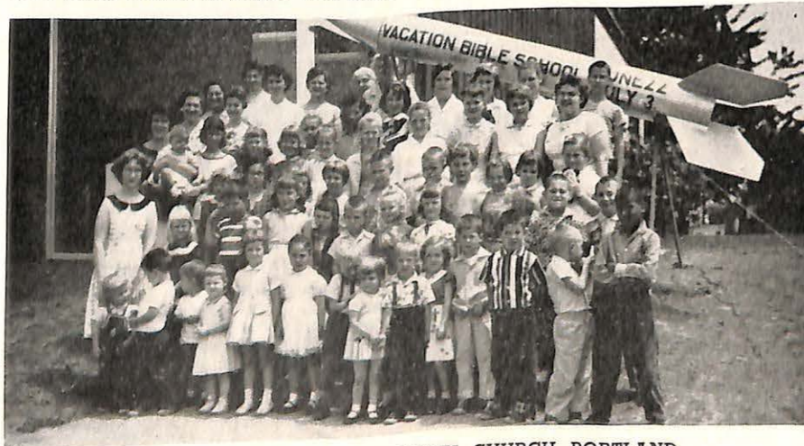
VACATION SCHOOL, IMMANUEL CHURCH, PORTLAND