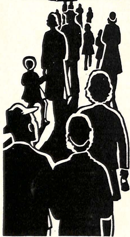
If we prayed the prayer for revival, and really meant it, God would not withhold his saving grace and abundant blessings.

ONE OF THE primary objectives of the Baptist Jubilee Advance is a genuine revival of religion in our churches. We must understand what this means. What follows in this article is by no means a complete answer. It is hoped that it will guide our thinking in the right direction. Because of the ground covered, the discussion is quite general in nature. It is assumed that our common conviction is that we need a revival. This effort is an attempt to look at what we face.