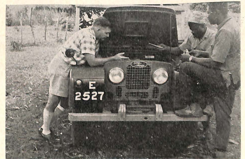
IT LOOKS LIKE MOTOR TROUBLE!