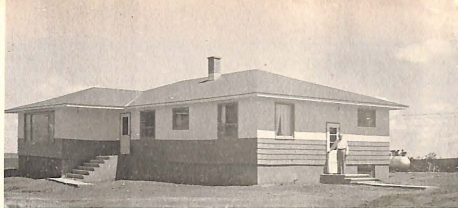
NEW PARSONAGE AT HILDA, ALTA.