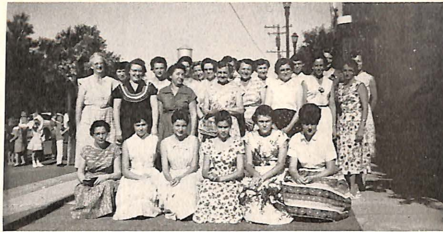
VACATION SCHOOL STAFF, ELK GROVE, CALIF.

The Vacation Bible School of the Immanuel Church, Portland, Oregon, displayed a 12 foot rocket in front of the church.