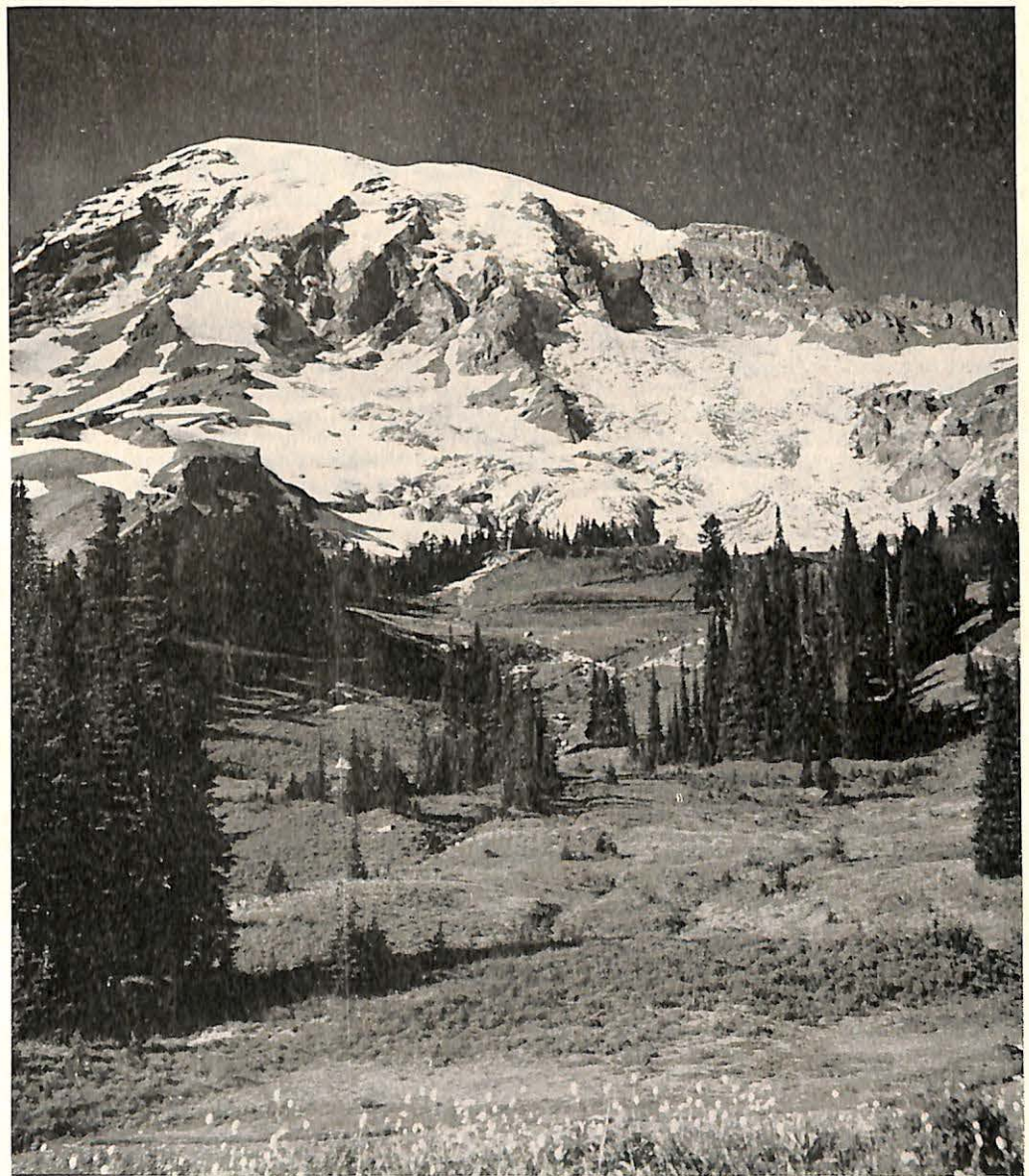
Majestic Mount Rainier in Washington

NORTH AMERICAN BAPTIST GENERAL CONFERENCE